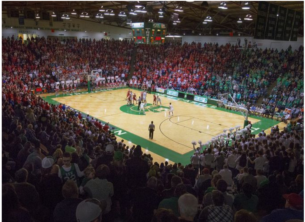
At capacity, New Castle's Fieldhouse seats 9,325.