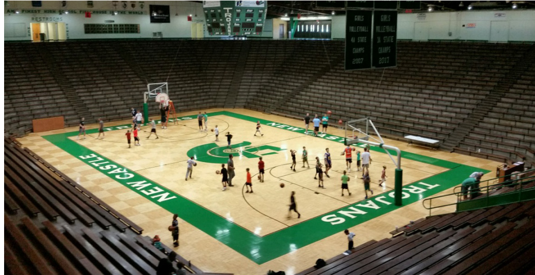
New Castle is home of the world's largest high school fieldhouse.

While selecting loudspeakers for a venue is important, selecting the right microphone should not be taken lightly. One factor to consider when selecting a microphone depends on your workspace. If courtside or in a press box with an open window, a close mic with a cardioid pattern that minimizes the surrounding noises would be a solid choice. If you are located in an enclosed environment where ambient noise is controlled, then a microphone with moderate pattern